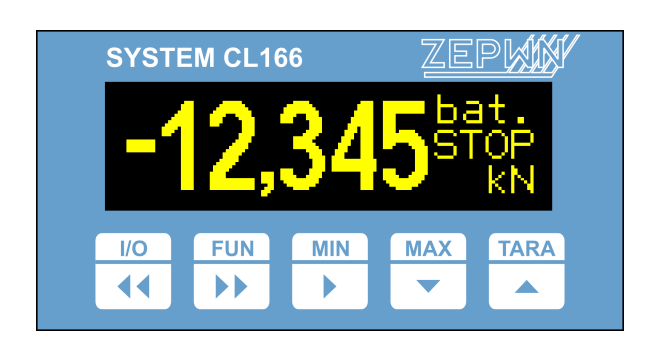
Front pannel of CL166

The meter is also equipped with a real time clock, thanks to which the date and time of its execution are remembered together with the measurement result. The meter has a USB connection that allows you to transfer information to and from a computer. The CL166 is battery operated which, combined with its compact dimensions, makes it a convenient and portable measuring instrument.